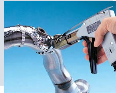
HEAT SHIELD APPLICATION