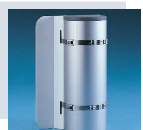
SIGN HANGING APPLICATION