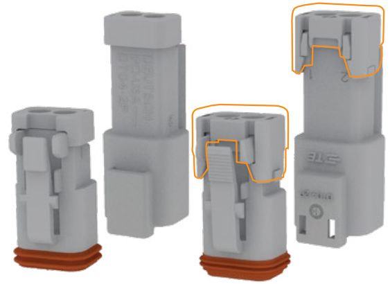
DT WELD CAP

The new versions are validated to all of the historical DT connector requirements, offering interface compatibility with all previous mating connectors and interfaces, while making a seamless transition from legacy design to future designs.