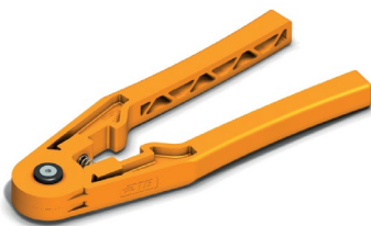
SOLARLOK hand tool 2341979-1