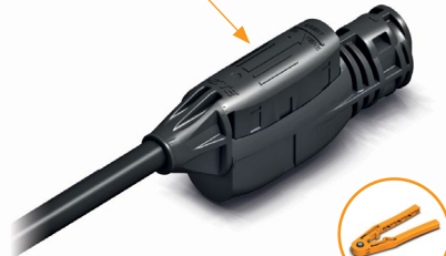
PRESS BUTTON (terminate cable)