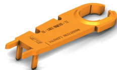
SOLARLOK delatch tool 2342988-1