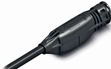
READY (fully closed)

Note: for detailed instructions, check Application Specification 114-133104